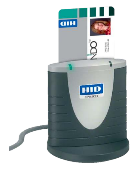
Figure 4: Omnikey CardMan 3121 USB CCID Smard Card Reader

sysmocom offers suitable USB CCID compliant card readers at https://shop.sysmocom.de/SIM/Card-Readers-Writers/