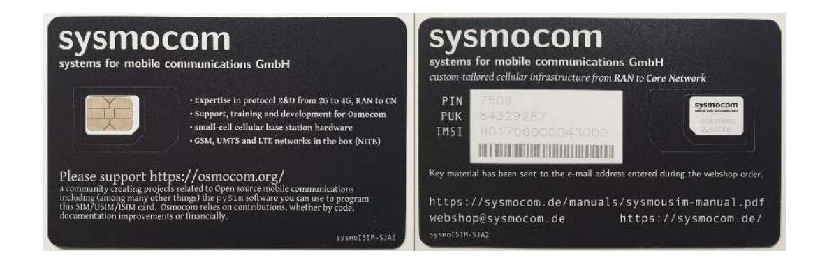
Figure 3: sysmoISIM-SJA2

The sysmoUSIM-SJS1 and sysmoISIM-SJA2 are Java SIM card with the following specifications and features: