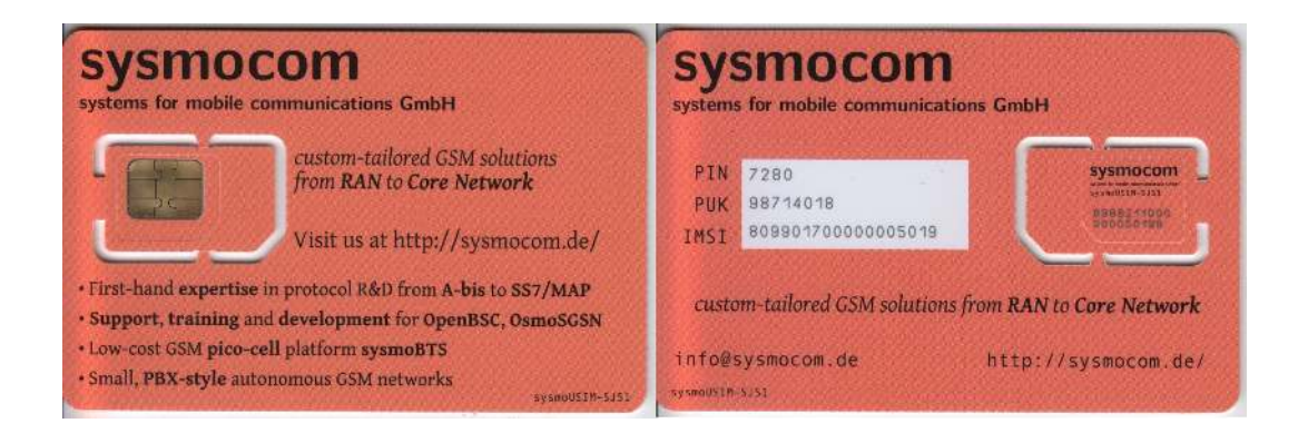
Figure 2: sysmoUSIM-SJS1